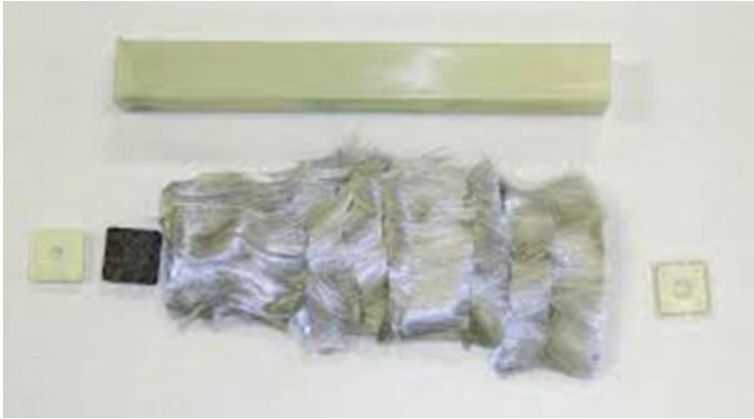
A chaff "bundle" is packed inside a cartridge that remains inside the aircraft (top of photo). The black felt spacer and the two white plastic end caps are released with the chaff fibers and fall to the ground.

Chaff and flares, also referred to as defensive countermeasures, are dispensed by military aircraft to avoid detection and targeting by enemy air defense systems. Pilots deploy these countermeasures when threats are detected. It is vital that pilots train to become proficient in their use.